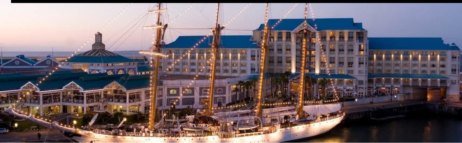
TABLE BAY HOTEL