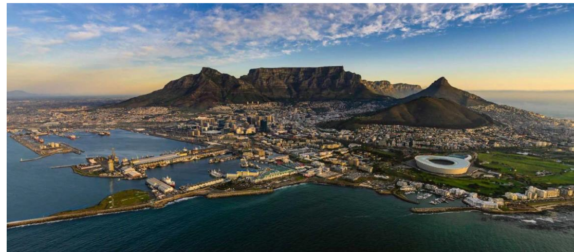
Table Mountain | Victoria & Alfred Waterfront | Robben Island | Cape Point | Kirstenbosch Botanical Garden | Beaches | Cape Winelands | Variety of Hotels | Large Conference Centre | Restaurants, Bars and Food Culture | Modern International Airport | Shopping

With a distinct flavour of its own, affected in no small part by the cultural melting pot of Indonesian, French, Dutch, British and German settlers who each indelibly stamped their mark upon the foundations of the city, Cape Town is one of the most beautiful cities in the world today. The inner city is an eclectic mix of architectural styles that combine the past with the present in a mishmash of high-rise office blocks, Edwardian and Victorian buildings and narrow, cobblestone streets that give rise to fine Examples of Cape Dutch design.