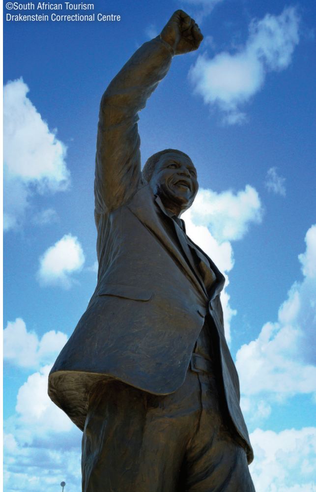
Drakenstein Correctional Centre

The Western Cape is a hugely diverse province, a melting pot of cultures and heritage, all of which have had an impact on our landscape. Few people, however, have left a bigger impression than former South African President Nelson Mandela, both in terms of the Western Cape and the country as a whole.